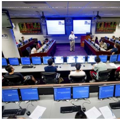
Subotnick Financial Center