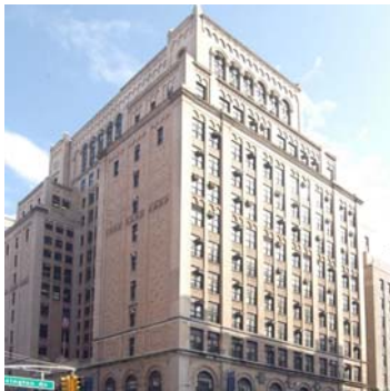
17 Lexington Avenue