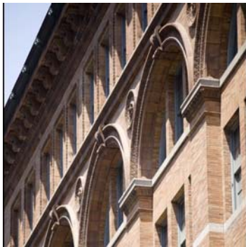
Newman Library Building