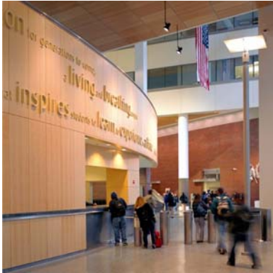
Interior entry area of the Newman Vertical Campus Building