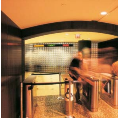
Interior Newman Library Building