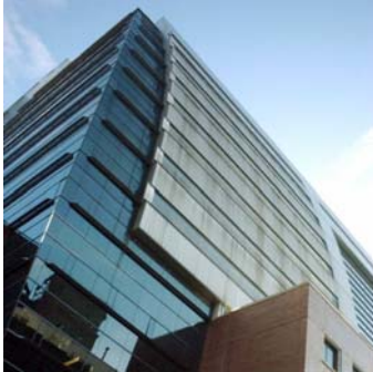
Newman Vertical Campus

55 Lexington Avenue at East 24 th Street